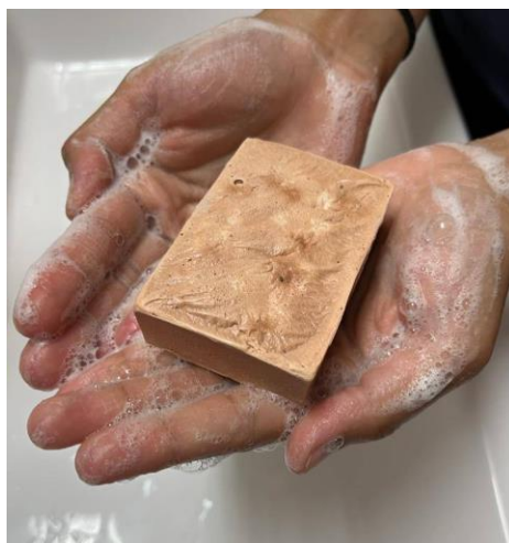
Fig 2:- Saponification