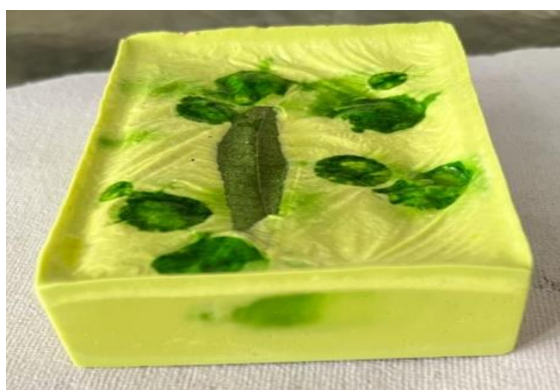
Fig.- 9 Neem soap