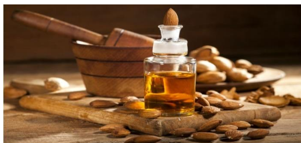
Fig-8 Almond oil