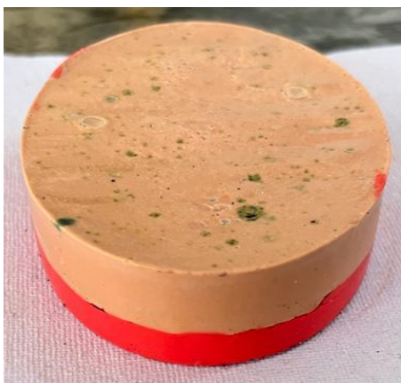
Fig.-12 Rose Almond Soap