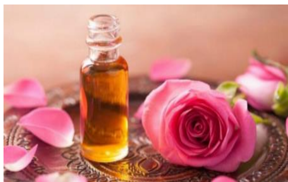
Fig-7: Rose oil