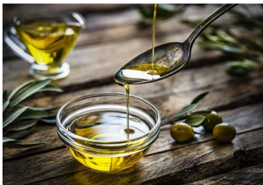
Fig 6: Olive oil

Benefits: Olive oil as a base ingredient due to its deeply moisturising and nourishing properties. Also be used as a pure body oil, hair treatment, or natural soap which can help to relieve dry skin and