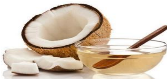
Fig 5: Coconut oil