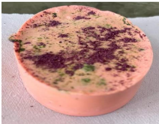
Fig.-10 Rose Soap