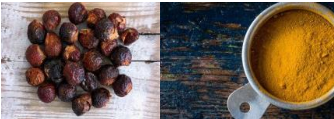
Fig-1 Cleansing agent- Aritha and Turmeric

The nut was used in ancient China as well and its usage spread from India to Middle Asia and then Europe. The skincare routines of ancient Indians involved the addition of a variety of herbs such as turmeric, tulsi (holy basil), neem (bark and leaves), lotus petals and sandalwood paste amongst others which were common ingredients in their skincare creams.