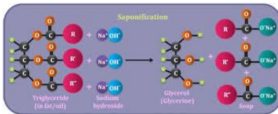
Fig 3:- Saponification process