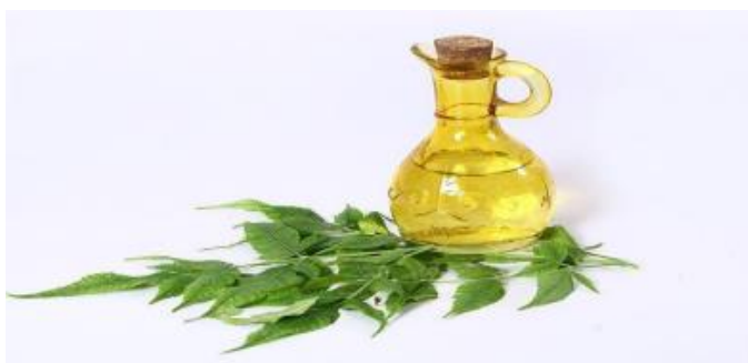
Fig-4: Neem oil

Botanical name of neem: Azadirachta indica