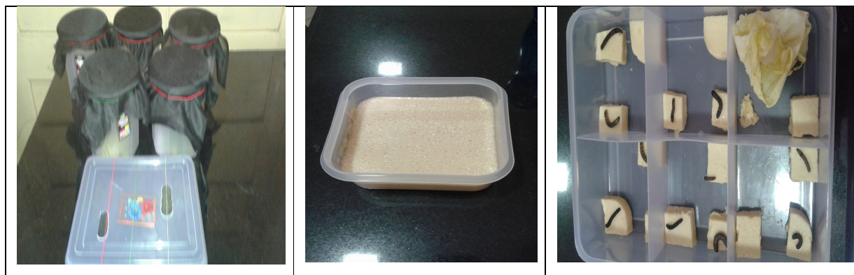
Figure 1: Rearing of Spodoptera litura in lab conditions ( 27\pm 2^{\circ}\text{C} , 65% RH)

Larvae of Spodoptera litura were collected from castor and cotton fields (200-300 larvae). They were reared in controlled laboratory conditions i.e. 25\pm 2^{\circ}\text{C} , 65-70% RH and a photoperiod of L: D, 14:10. It was reared on artificial diet. 9 The diet was poured in a plastic container which had partitions in it. The larvae were carefully transferred on diet by using brush. The diet was changed at regular intervals.